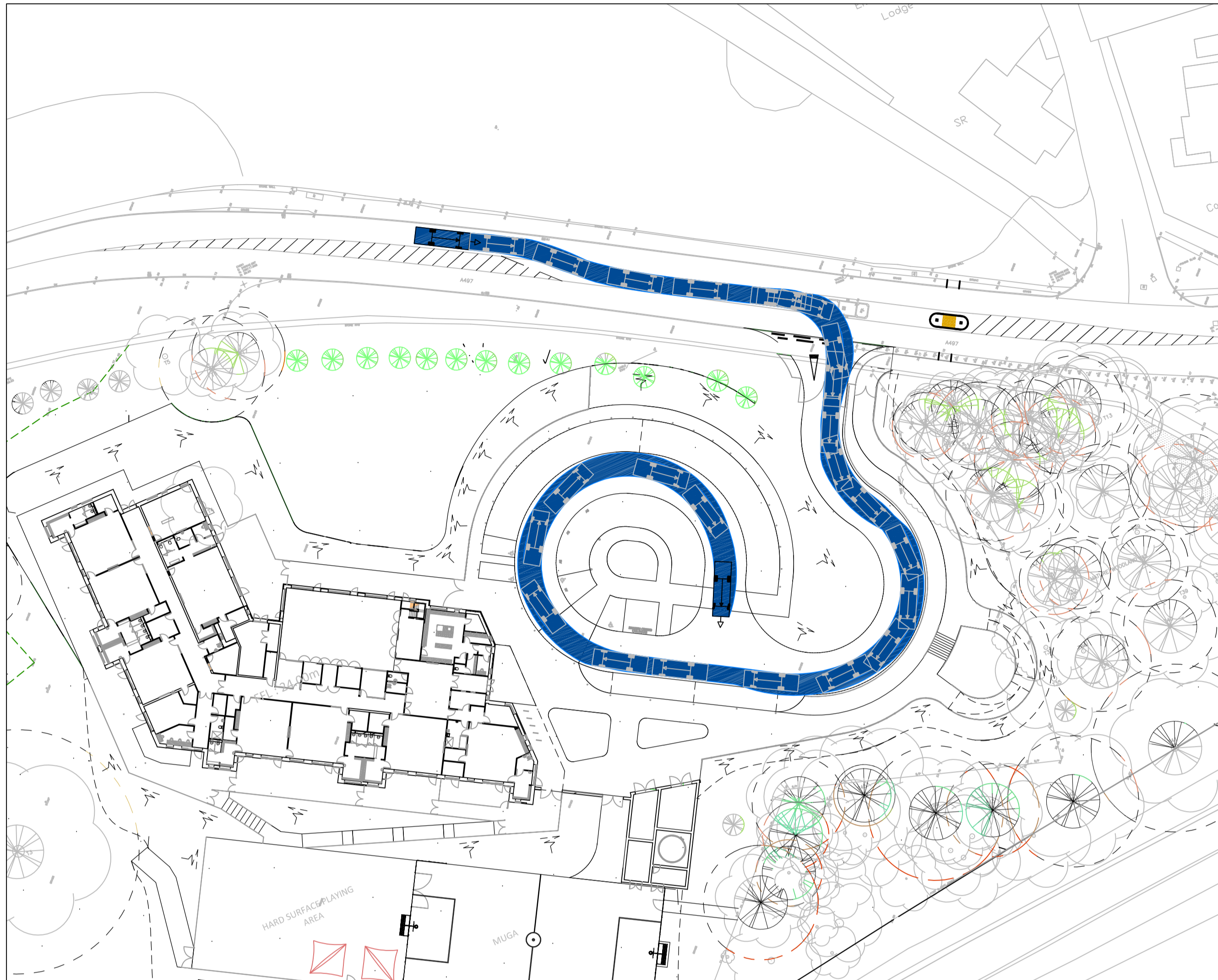
LARGE REFUSE TRUCK ENTERING SITE SCALE 1:500