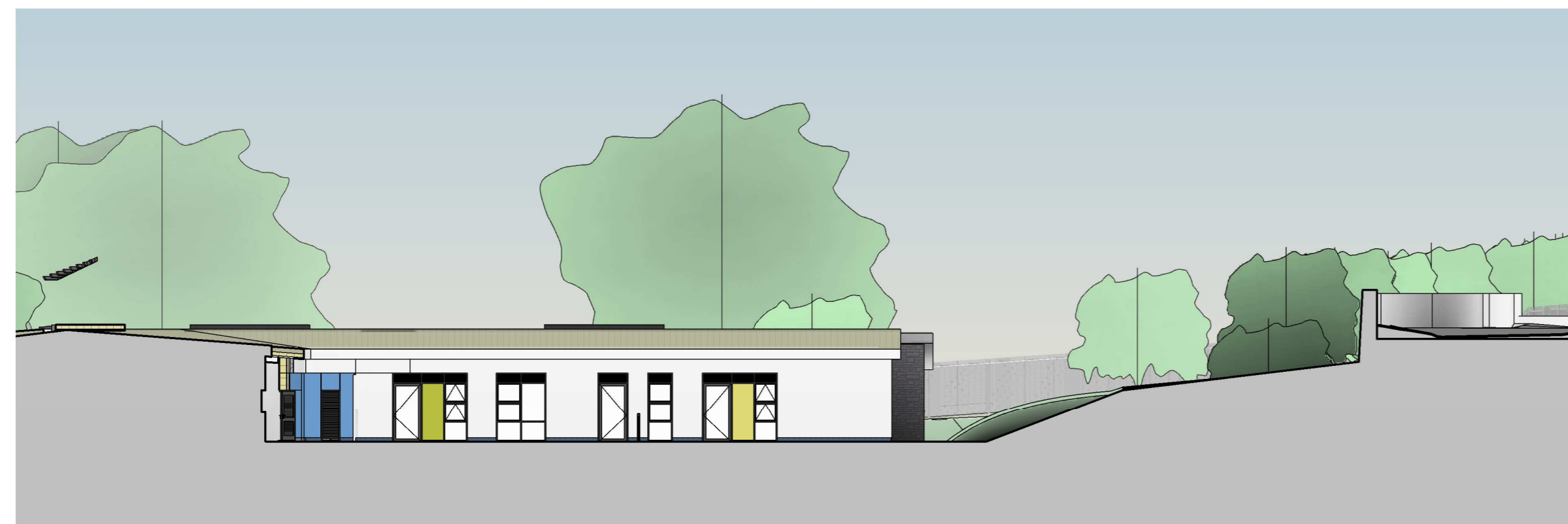
4 | EAST ELEVATION - CLASSROOMS SCALE: 1 : 200