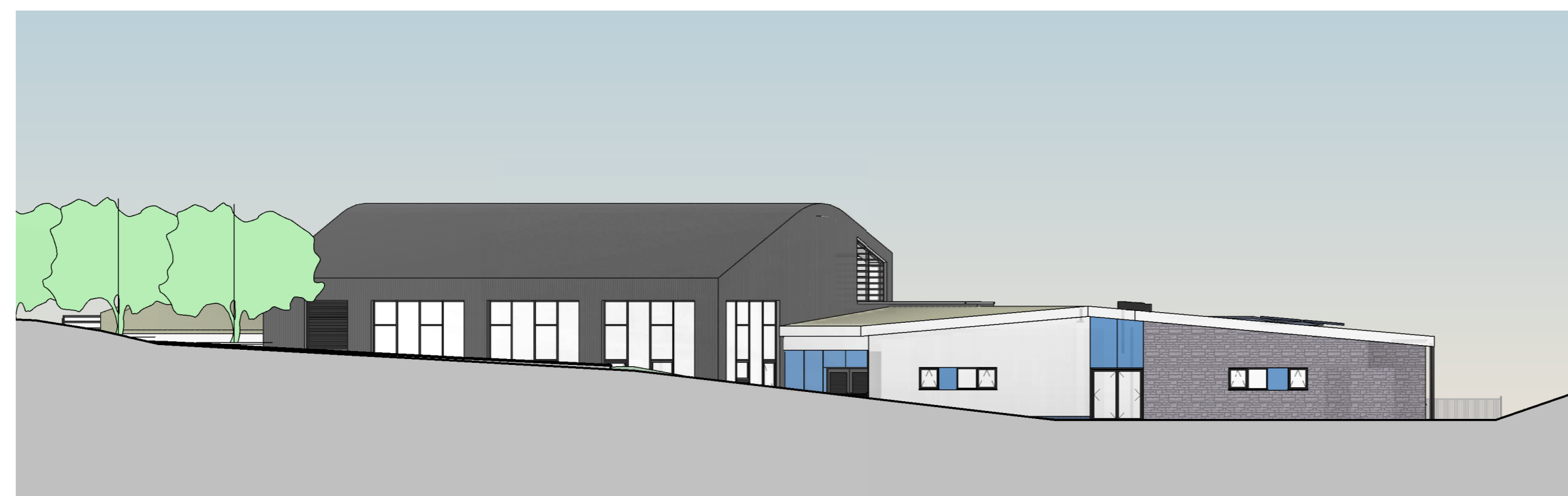
5 | NORTH ELEVATION - CLASSROOMS SCALE: 1 : 200