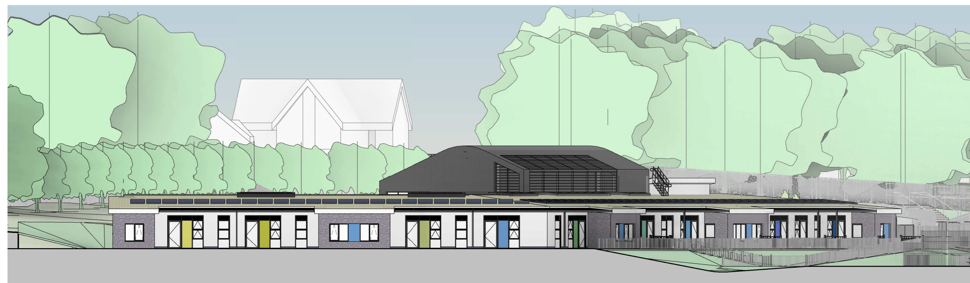
6 | WEST ELEVATION SCALE: 1 : 200