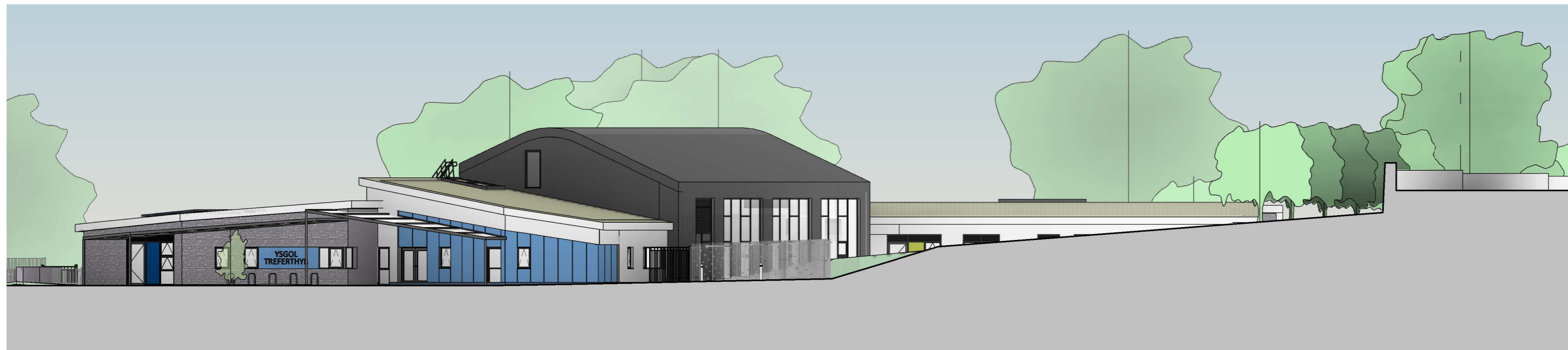
2 | EAST ELEVATION - ENTRANCE SCALE: 1 : 200