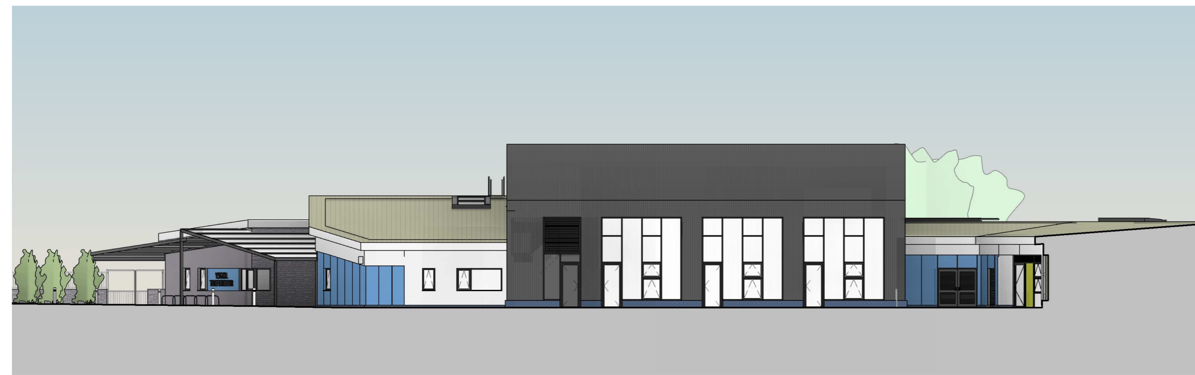
3 | NORTH ELEVATION - HALL SCALE: 1 : 200