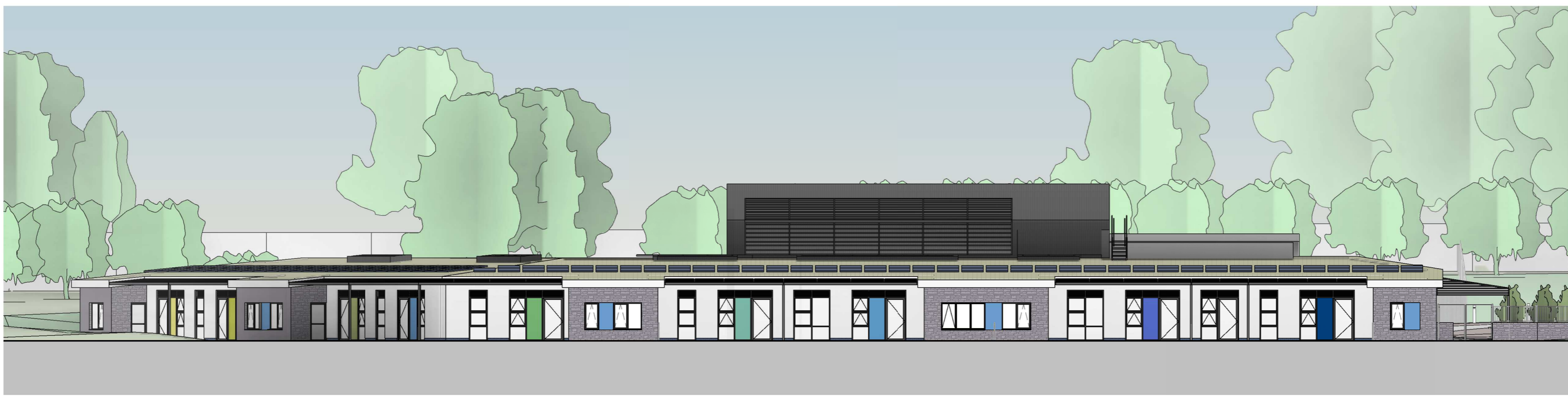
1 | SOUTH ELEVATION SCALE: 1 : 200