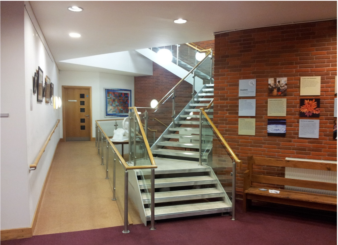
PHASE 1 - Completed 2006